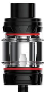
Adjustable Airflow Ring

Rotate the bottom adjustable airflow system to control air input. If you need any additional information or have any questions about the products or its use, please contact your local agent .